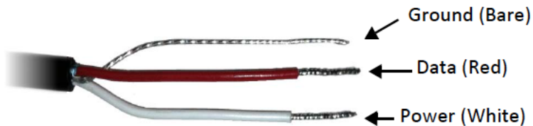
Figure 2: Pigtail End Wiring

Customers may purchase GS1 sensors for use with non-Decagon data loggers. These sensors typically come configured with stripped and tinned (pigtail) lead wires for use with screw terminals. Refer to your distinct logger manual for details on wiring.