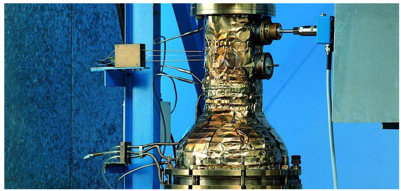
High temperature flow test facility HTP in closed construction 'University of Stuttgart'