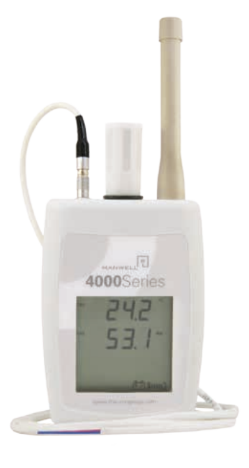
ML4107 – Radio transmitter

Radio transmitter code: ML4107-434.075 (other frequencies are available)