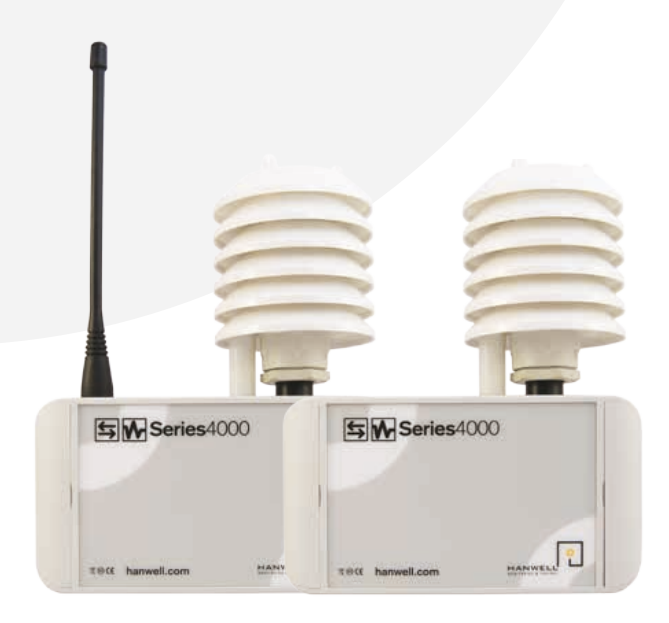
ML4109-OD – Radio transmitter & data logger Outdoor RH/T unit with onboard sensors.