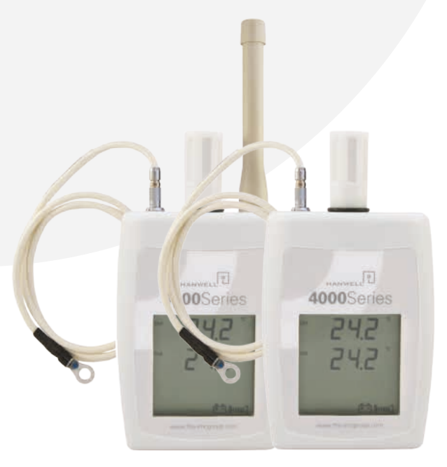
ML4108 - Radio transmitter & data logger RH/T unit with onboard sensors and optional remote surface temperature probe.