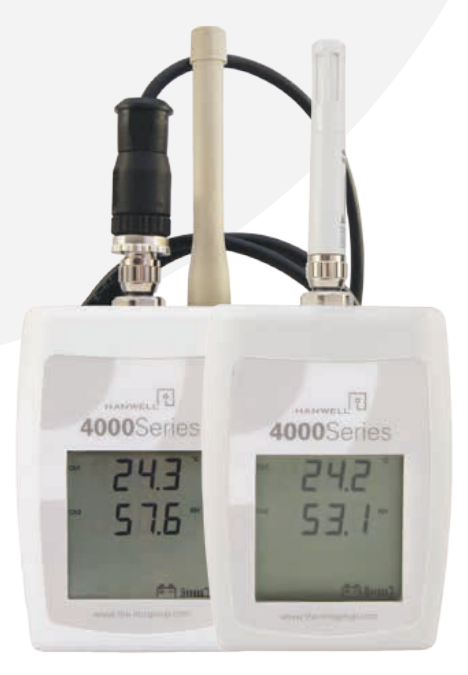
ML4114 - Radio transmitter & data logger RH/T unit high accuracy EE07 probe.