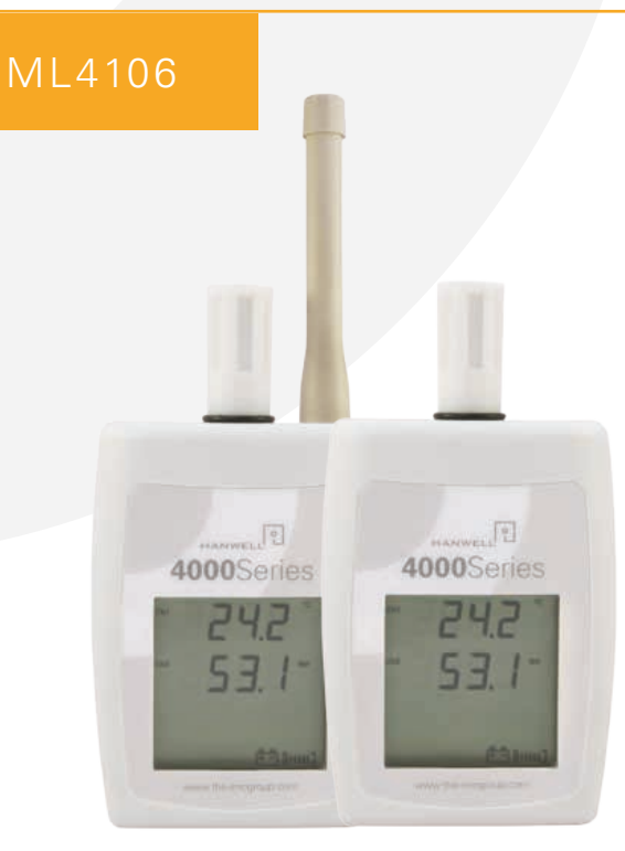
ML4106 - Radio transmitter & data logger