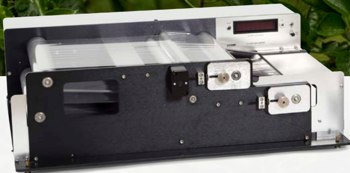
LI-3100C Leaf Area Meter