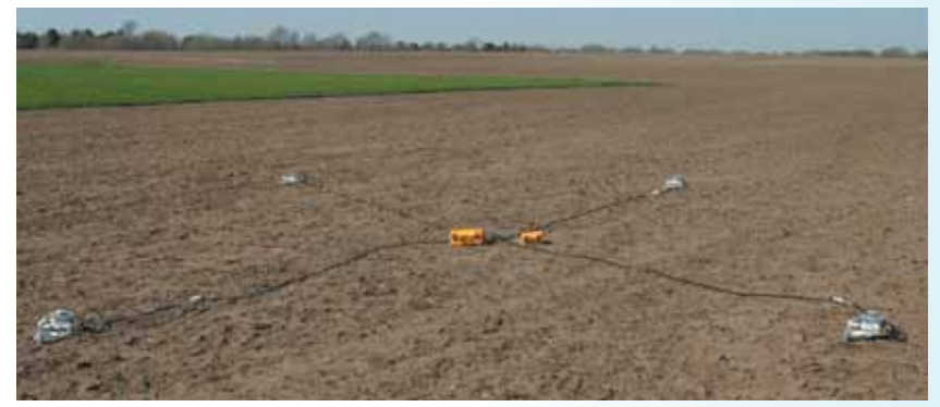
Four chamber system

Auxiliary sensors, such as soil temperature and moisture probes, can be connected at each chamber.