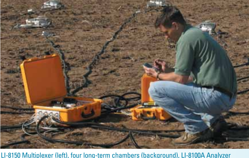
LI-8150 Multiplexer (left), four long-term chambers (background), LI-8100A Analyze Control Unit (right), communication through wireless PDA.