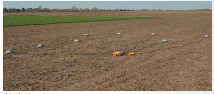
Eight chamber system

Additional uses for the LI-8150 Multiplexer: